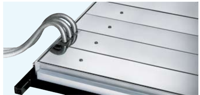
Fig. 6: BSH construction panel, inserted in a steel section frame