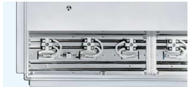
Fig. 4: Wiring space of a BSH construction panel