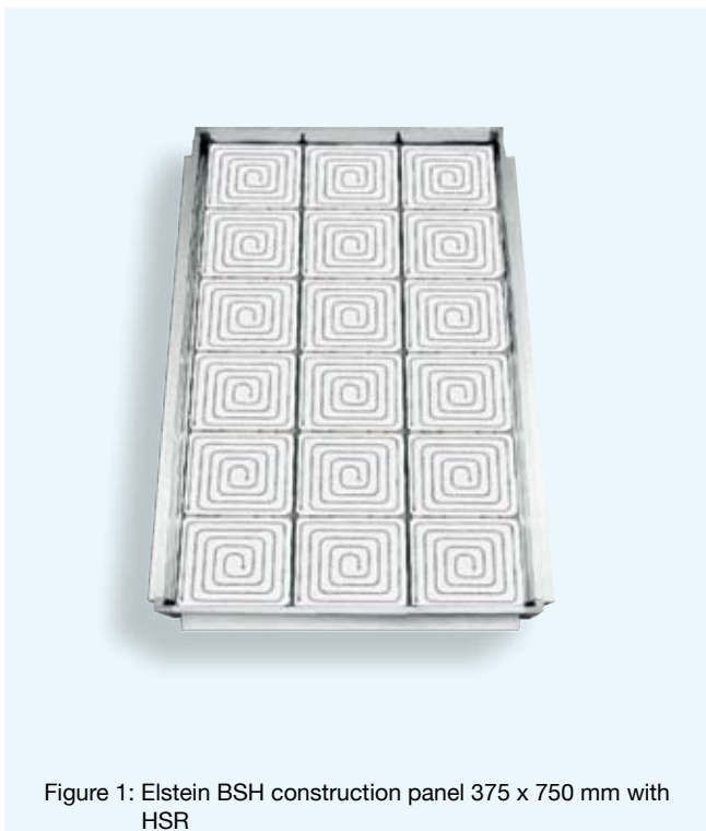
Figure 1: Elstein BSH construction panel 375 x 750 mm with HSR

The BSH construction panel system was developed for optimum use of Elstein's HTS and HSR ceramic panel radiators.