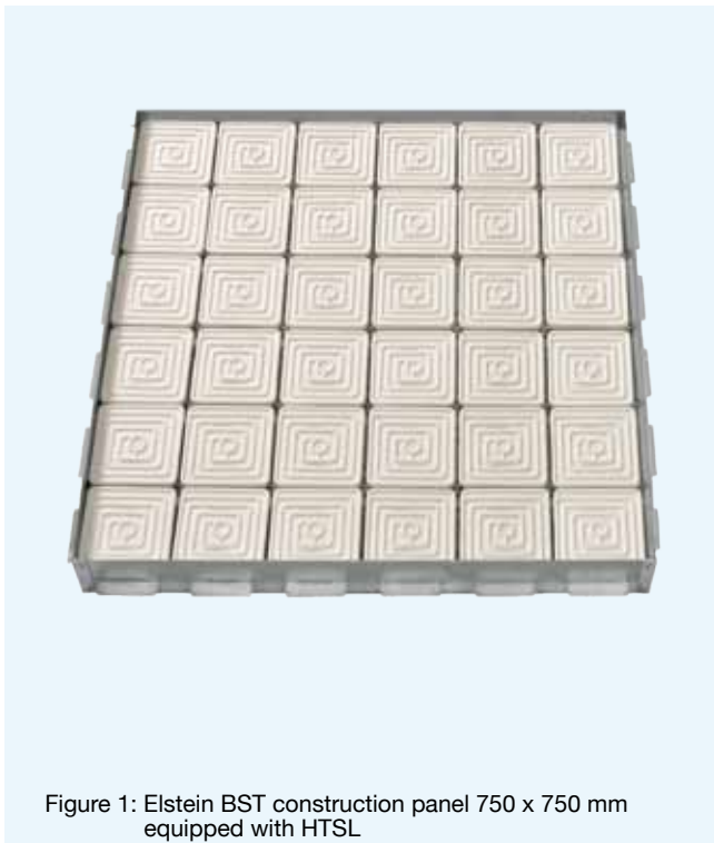
Figure 1: Elstein BST construction panel 750 x 750 mm equipped with HTSL

Elstein BST construction panels are thermally insulated infrared radiation areas, which are equipped with HTSL ceramic IR heaters.