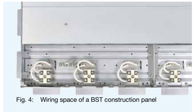
Fig. 4: Wiring space of a BST construction panel