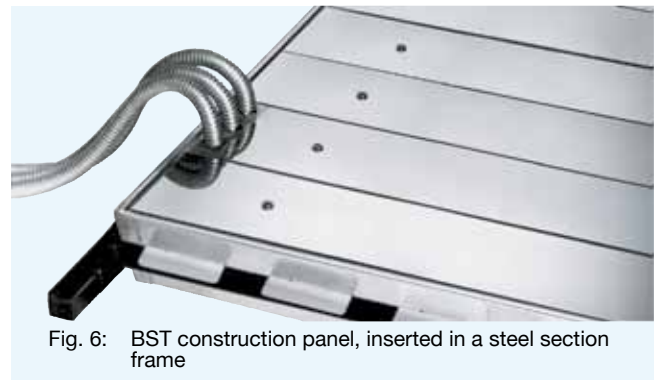
Fig. 6: BST construction panel, inserted in a steel section frame